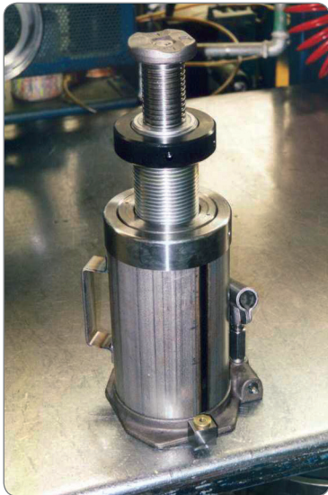
Bottle jack with lock nut