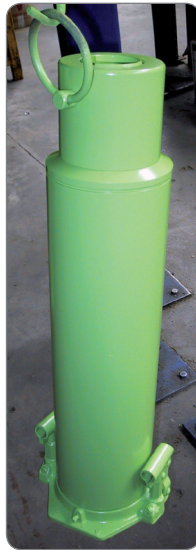
50 Tn, 2 speed, long stroke bottle jack